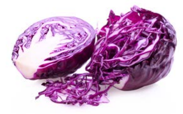
Blue / Purple. Properties: Anthocyanins give blue and purple foods their rich colours.

Suggestions: Apples, asparagus, avocados, celery, courgettes, cucumbers, green grapes, leeks, lettuce, limes, mange tout, sugar snap peas and don't forget leafy green vegetables.