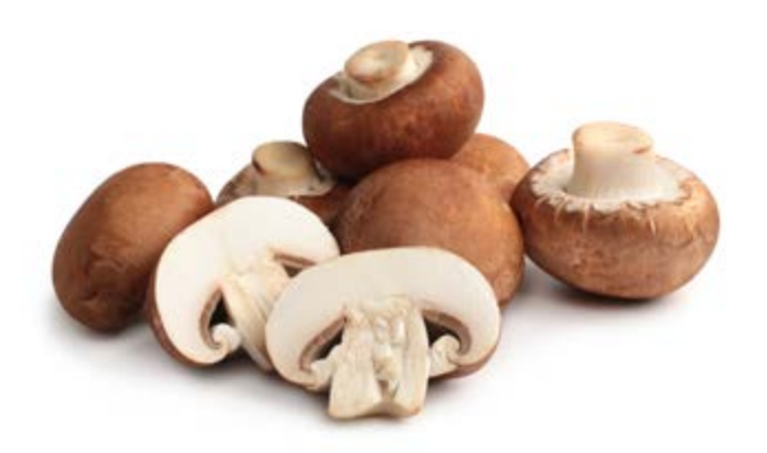
White/Beige. Properties: Anthoxanthins are the pigments that create white or cream colours.

Suggestions: Aubergines, blackberries, blackcurrants, purple grapes and red cabbage.